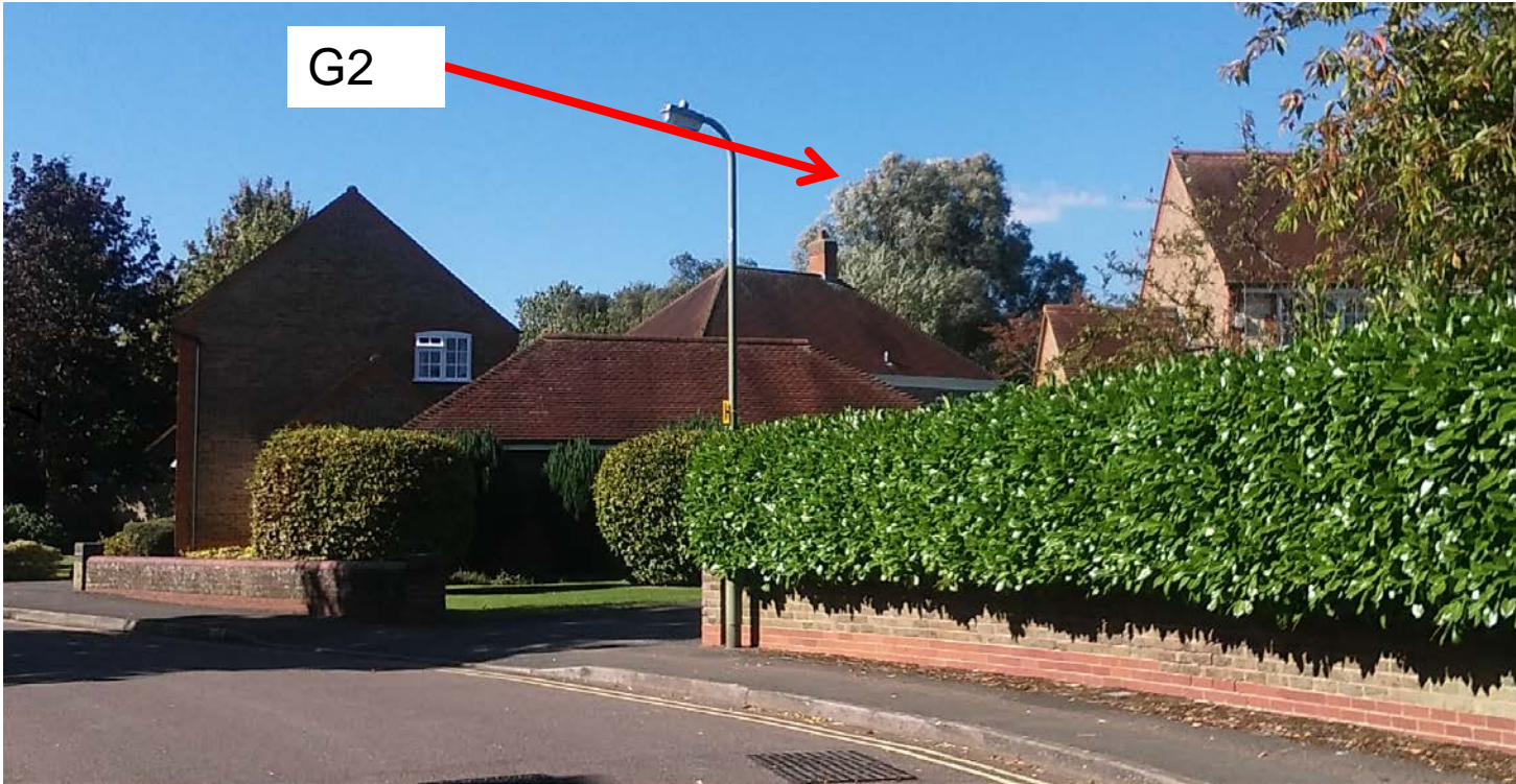
View of G2 looking west from near 42 Charlbury Road