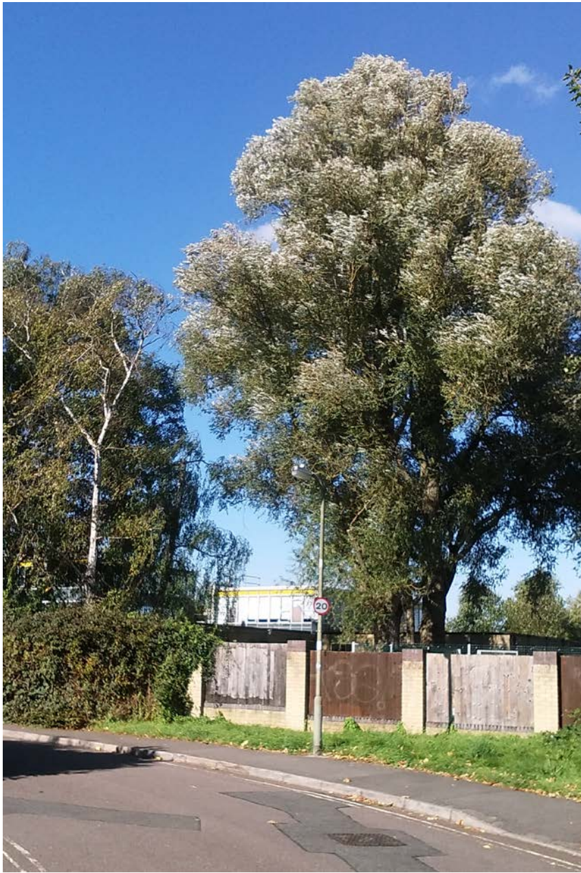
View of G2 looking north from near 33 Charlbury Road